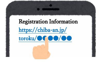
Chiba City HP Novel Coronavirus